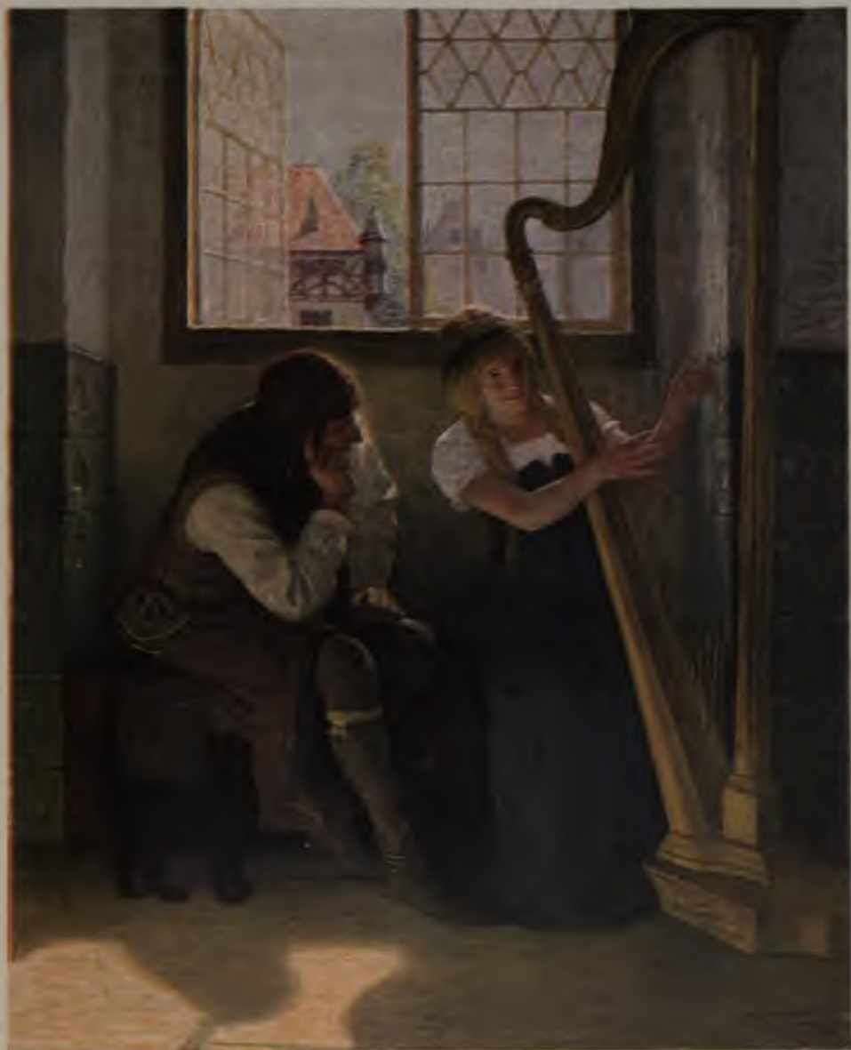
Painting by N. C. Wyeth

MARGET WAS CHEERFUL BY HELP OF WILHELM MBIDLING